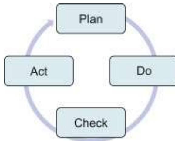
Figure 1. Plan, Do, Check, Act (PDCA) Cycle 4