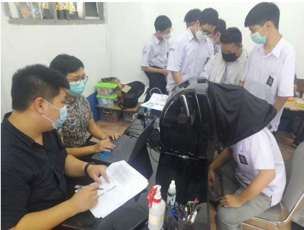
Figure 3. Hydration and UV Damage Inspection Process