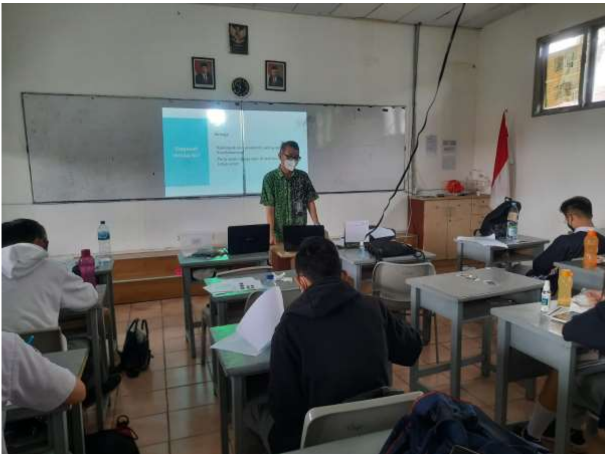
Figure 2. Counseling Process for Students of SMA Kalam Kudus II Jakarta